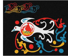
Figure5: Han portrait stone packaging design