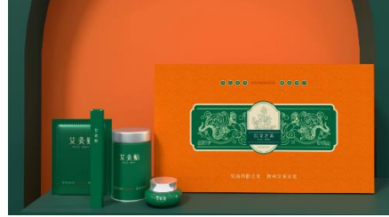
Figure7: Wormwood product packaging Source of the picture: Hand-drawn by the