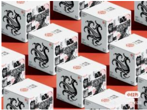
Figure3: Han portrait stone packaging design

plays an important role in adjusting and strengthening the sense of movement and rhythm of the picture, reflecting the beauty and coordination of the form of beauty.