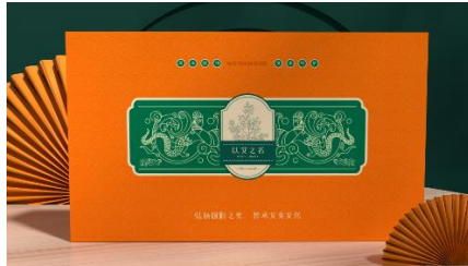
Figure6: Wormwood product packaging