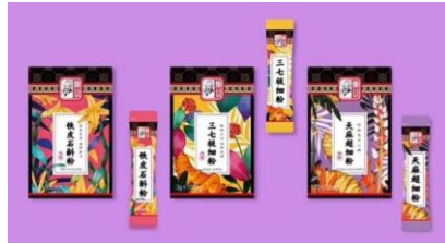
Figure4: Han portrait stone packaging design