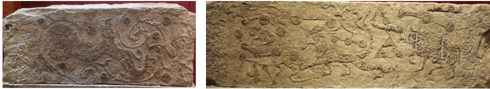
Figure1: Nanyang Han portrait stone Figure2: Nanyang Han portrait stone

การประชุมวิชาการและนำเสนอผลงานวิจัยระดับชาติ ครั้งที่ 6 วันที่ 2566 กันยายน 6