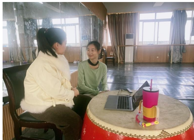
Figure 3: Author's Case Study Survey of Teachers in Nanchong City Youth Palace

used. Students at different learning stages were used as research subjects, such as initiation (4-6 years old), elementary (7-8 years old), intermediate (9-10 years old), and advanced (11-12 years old). The case study method was adopted, thus focusing in a point manner and forming a comprehensive observation and reflection on the teaching of ballet aesthetics.