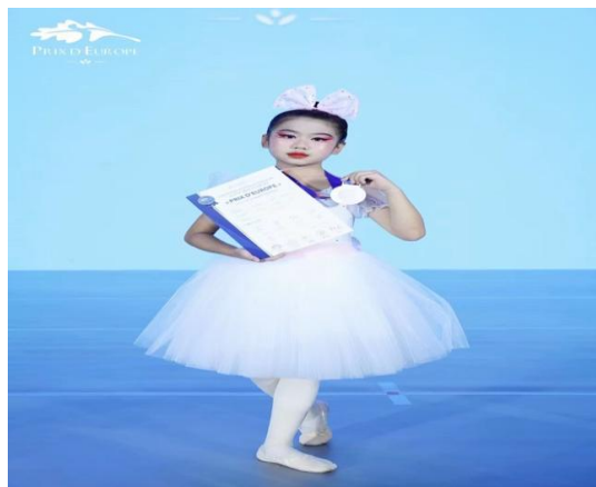
Figure 5: Students of Jingya Dance School in Nanchong receiving awards in PDE competition

Fourth, students' musical literacy is strengthened by integrating physical performance with musical expression. Use musical emotion to accentuate physical performance, and vice versa, physical performance presents musical emotion. Enhance the aesthetic performance in the synthesis of sight and sound. The cultivation of aesthetic awareness in ballet teaching requires teachers and students to have a common understanding, and to constantly raise awareness, improve aesthetics and strengthen training in teaching. The use of scientific and effective methods of training, so as to refine the ballet teaching in the enhancement of aesthetic awareness.