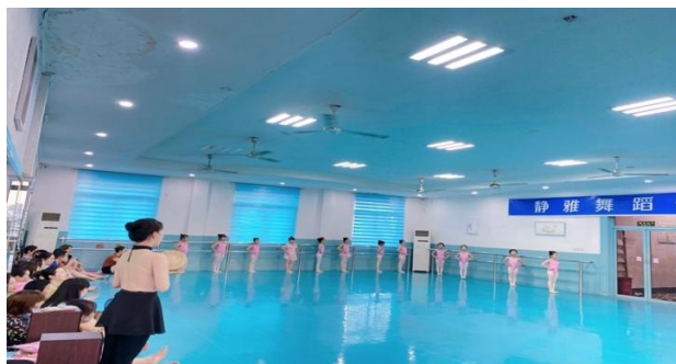
Figure 2: Jingya Dance School Classroom Field Recordings

Fieldwork, also known as fieldwork or field study, is a concept that belongs to the category of anthropology. It is mainly used in the study of natural and social sciences, which requires the investigator to live with the subject for a period of time, from observation, understanding and knowledge of their society and culture. In this study, the author conducted field research on local ballet training institutions, youth and other dance teaching organizations that offer ballet instruction. Comparative observations and records were made between traditional teaching and teaching that consciously develops a sense of beauty.