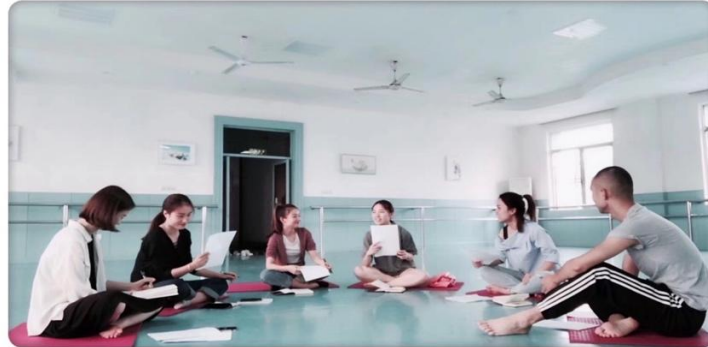
Figure 4: Author's interviews with teachers of Jingya Dance School in Nanchong, China

The 16 th National and International Conference "Global Goals, Local Actions: Looking Back and Moving Forward 2024" 20 March, 2024