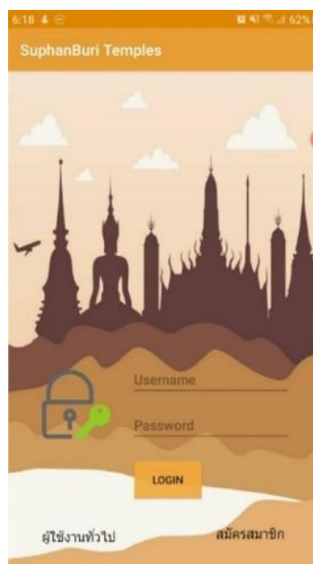
Figure 1: Main page

From fig. 1 in the login page section, it will be the home page of the application. by showing the login subscriptions for new users and the general user section who are not members. The registration page was illustrated in fig. 2 which the user can fill in the information and save member information by confirming the information with e-mail, password and confirm password. Then click the subscribe button and click the Login button to log in to the system.