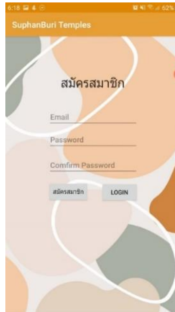
Figure 2: Registration page

The 14 th National and International Conference "Global Goals, Local Actions: Looking Back and Moving Forward "2021 18August, 2021